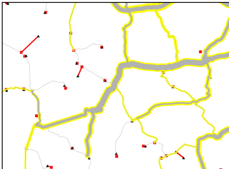
Figure 2: Saturday (yellow), week day (green), Friday (blue) traffic volumes displayed using the line segment width..