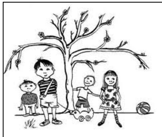
Figure 9: Pictures related to the course - visual, schematic and intellectual experiences.

videos collected that experienced by the pupils themselves and relate to performed learning.