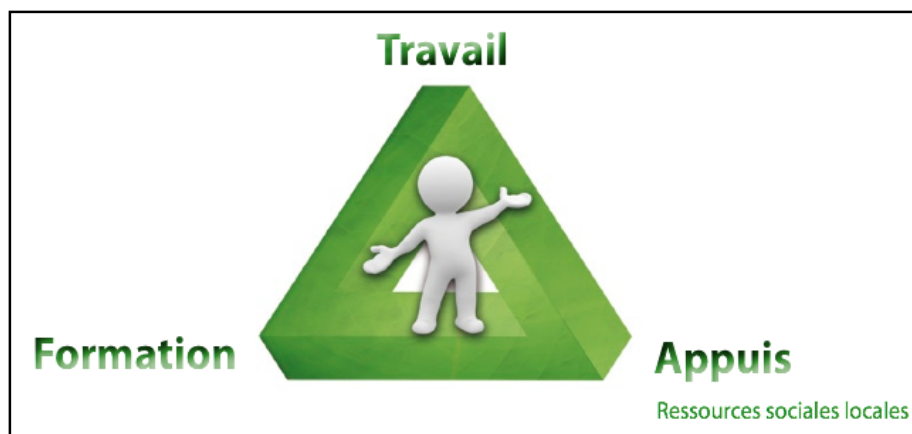
Figure 1: Handicap employment scheme.

In individual courses there are also photos and