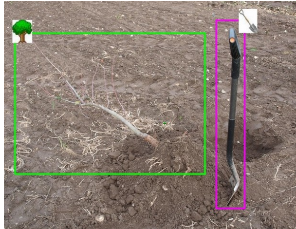
Figure 3: Description of main work object in known environment.