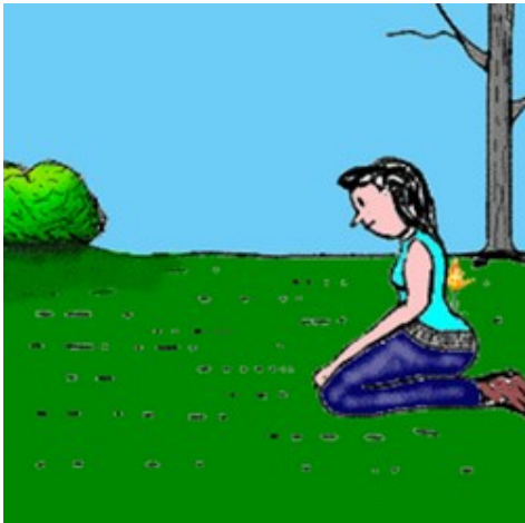
Figure 2: Sample animation of tree planting. This is the first frame of animation.