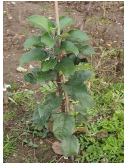
Figure 7: Pictures related to the course - visual, schematic and intellectual experiences.