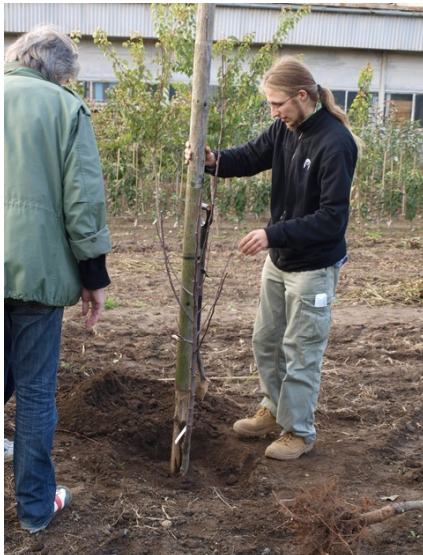
Figure 6: Implemented instruction - snapping a pillar of planted tree.